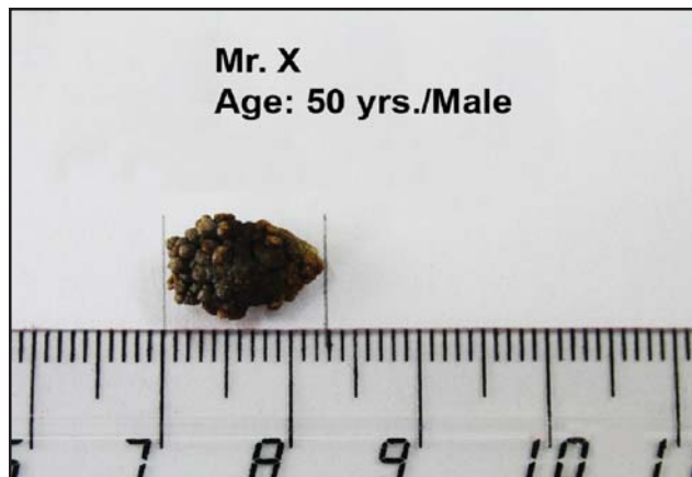
Length of the stone: 13 mm.