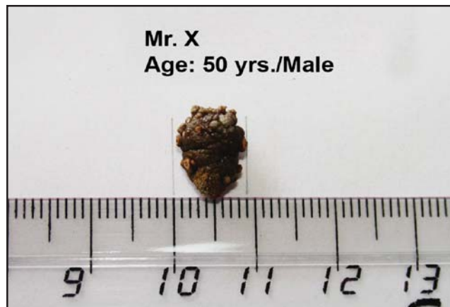
Width of the stone: 9 mm.

The case, however, leaves to the researchers a few questions open to discussion. These include the stimulating points like, 'how could a stone of size 16.9 mm be located at the uretero-vesicular junction, without